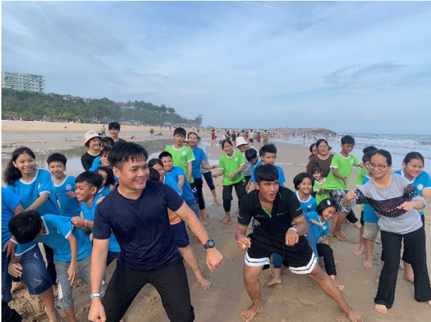
Bring smiles to their faces