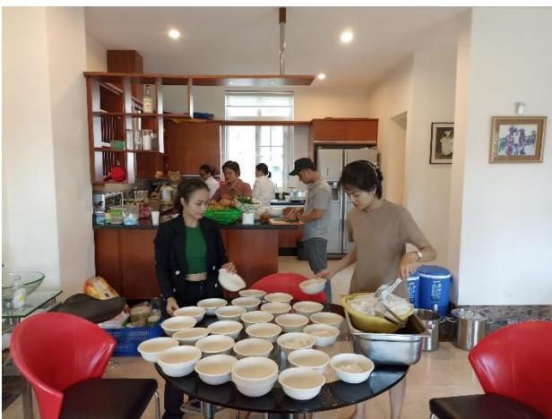
Preparing 60 meals

This annual seasonal activity is designed to provide them with a memorable experience, allowing them to enjoy the beauty of Phan Thiet beach while learning the values of care and companionship.