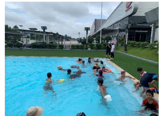
Orphans enjoy swimming

Other extracurricular activities organized by the Dan On Foundation at the factory include sports such as swimming and watching movies. We aim to provide the students with exciting experiences, opportunities for enjoyable learning, skill-building, and the creation of wonderful memories for them.