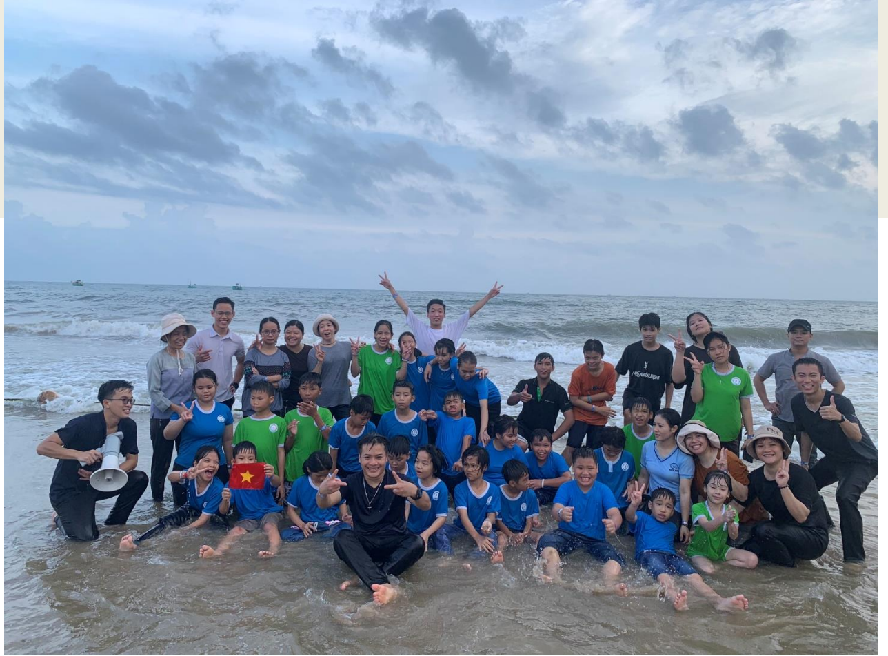
Summer Vacation Mui Ne Beach for orphans of Mai Am Tinh Me in Binh Duong