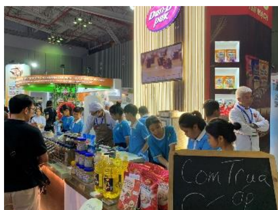
They learn how to work and gain a deeper insight into society

We takes pride in demonstrating social responsibility through organizing a meaningful visit for children aged 16 and above of Mai Am Tinh Me Orphanage to Vietfood Exhibition. The goal was to offer these young individuals a deeper insight into society and the value of labor. The children participated in exciting activities, join in the preparation of sample products and interacting directly with visitors.