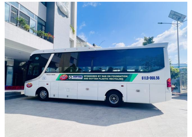
Bus 29 Seat

This asset is valued at 1,500,000,000 VND.