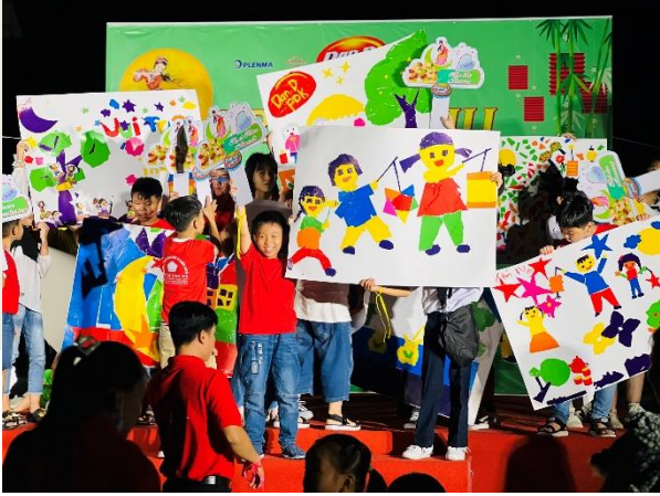
Mid-Autumn Night Fundraising for 100 orphans