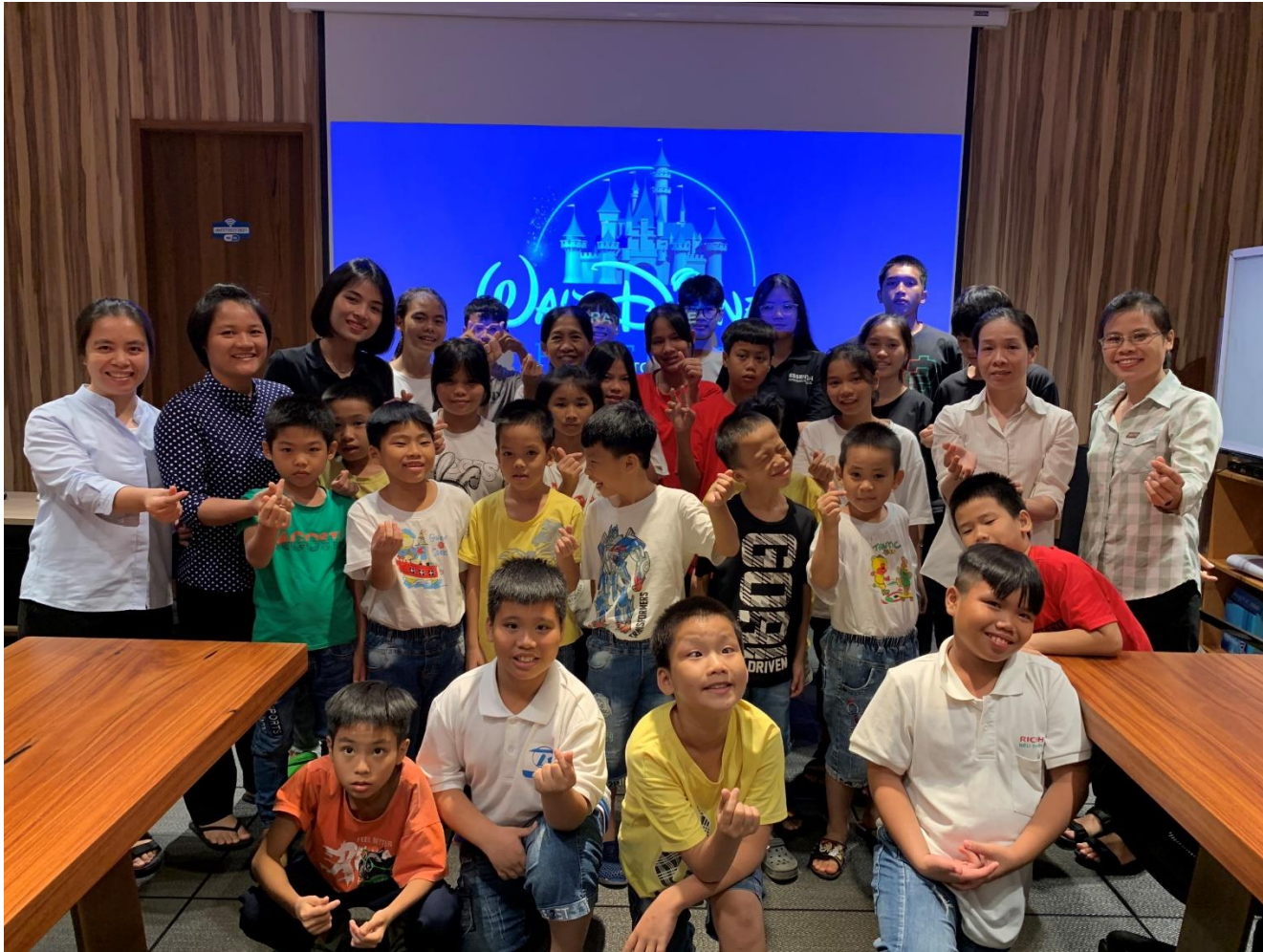
Watching movie together