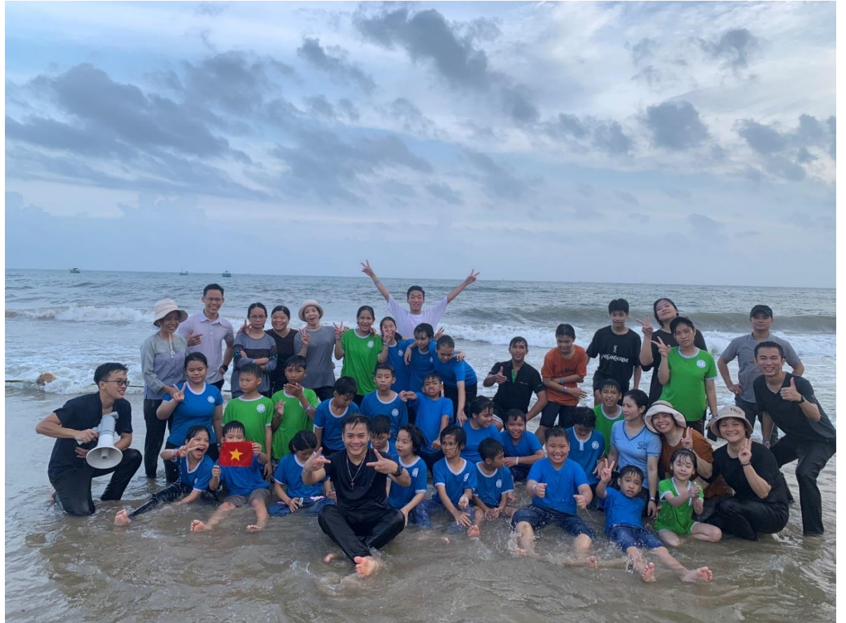
Orphans and our staff enjoy on the beach

Dan On Foundation are delighted to have organized a summer vacation for 40 orphans .